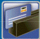
Step 2: Validate

mPay Gateway's payment calculator instantly determines the service charges for your patient.