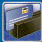
Step 2: Validate