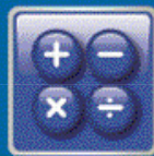
Step 1: Calculate

mPay Gateway's payment calculator instantly determines the service charges for your patient.