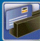
Step 2: Validate

mPay Gateway's payment calculator instantly determines the service charges for your patient.